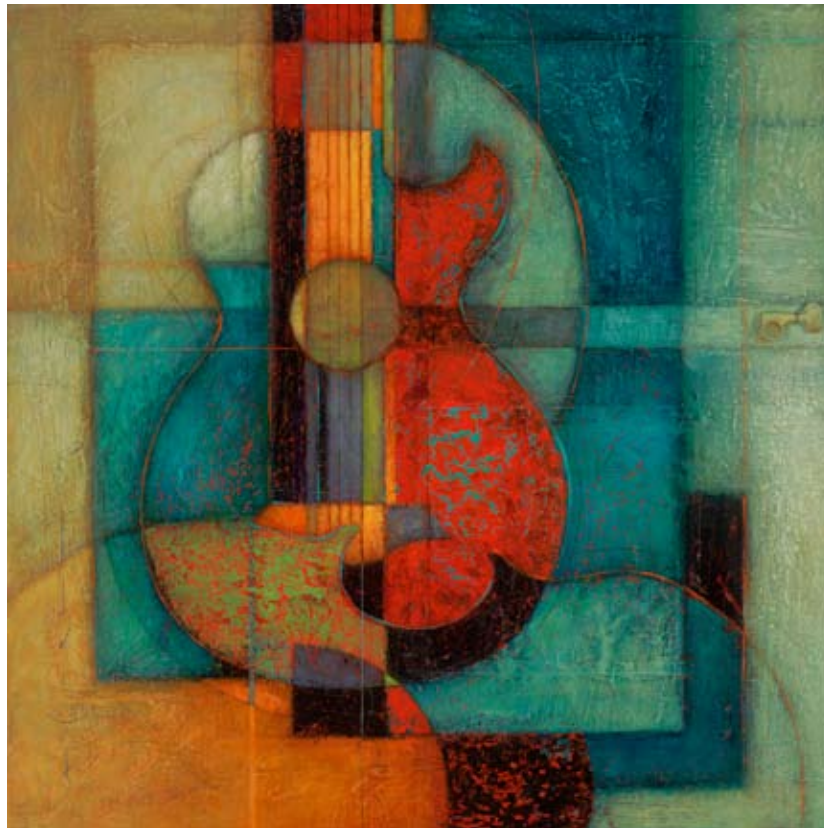
CARLA002 - Rhythm & Blue