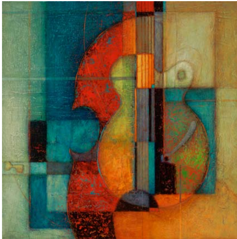
CARLA001 - Urban Sound