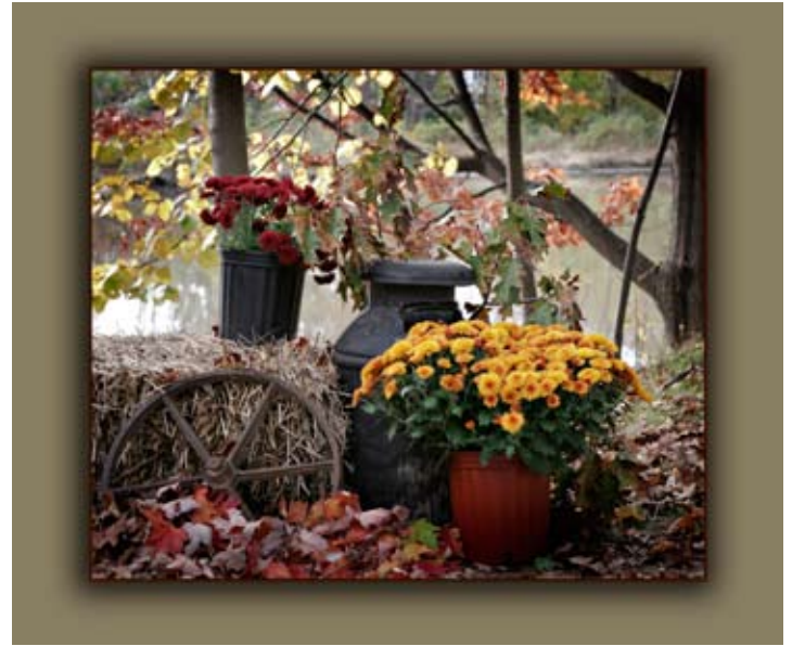
CART014 - Autumn Day