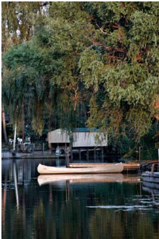
CART005 - Creek Days