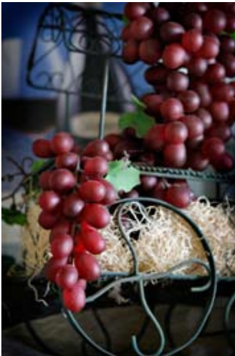
CART031-RED RED VINE