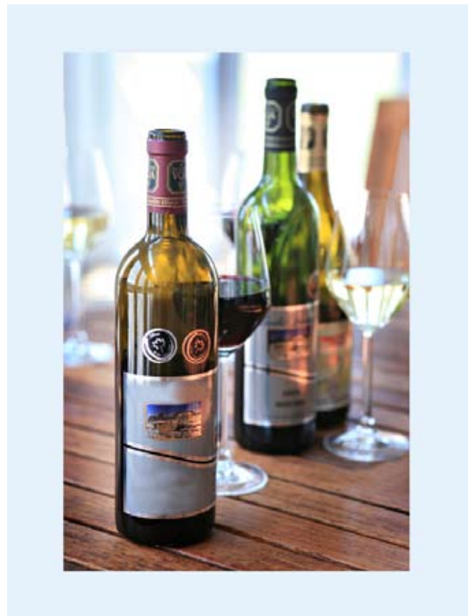
CART038-SUNNY WINE DAY