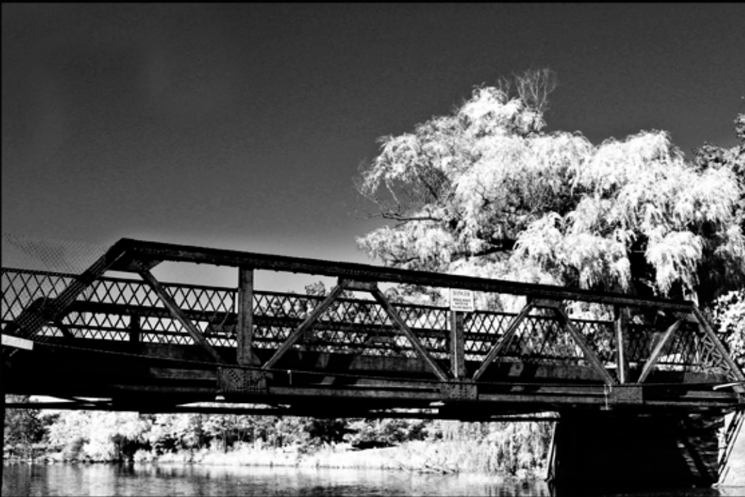
CART017 - Days Gone By