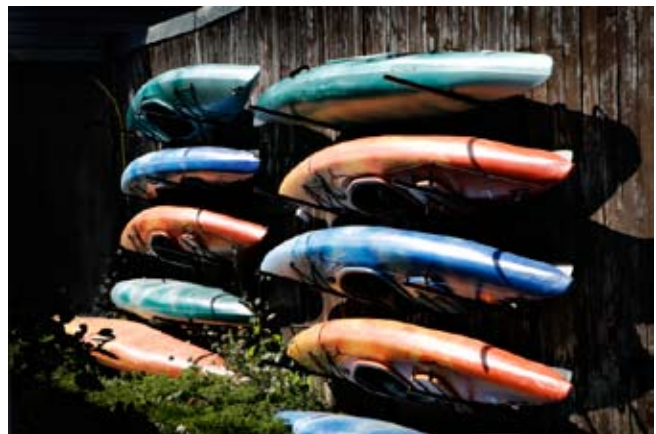
CART026-WALL OF KAYAKS