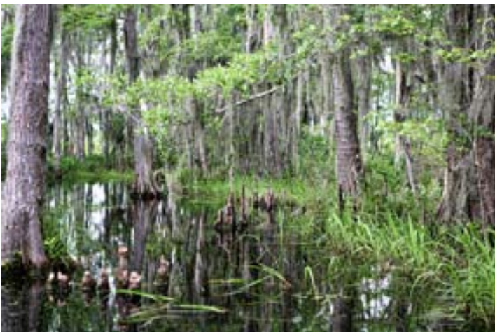
CART022-Louisiana Swamp Trees II