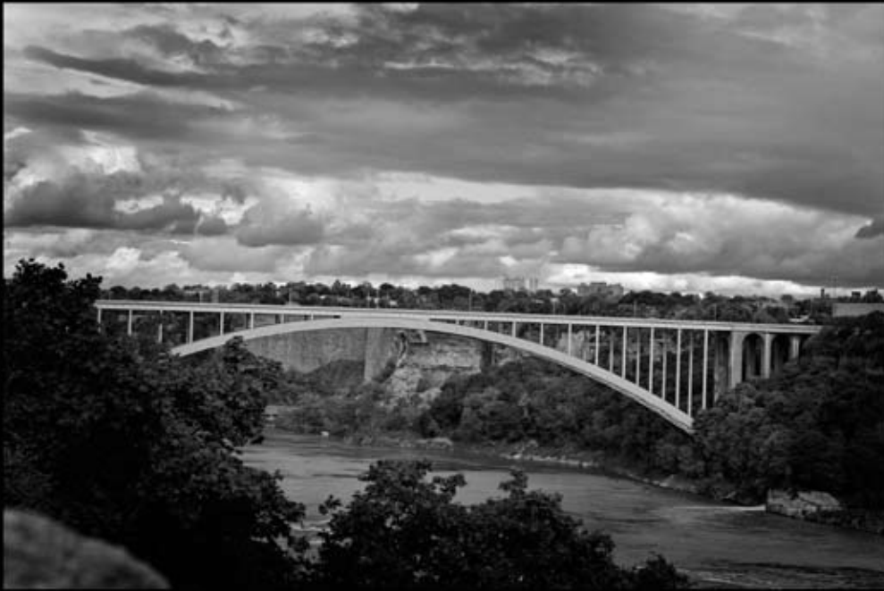
CART016 - Rainbow Bridge