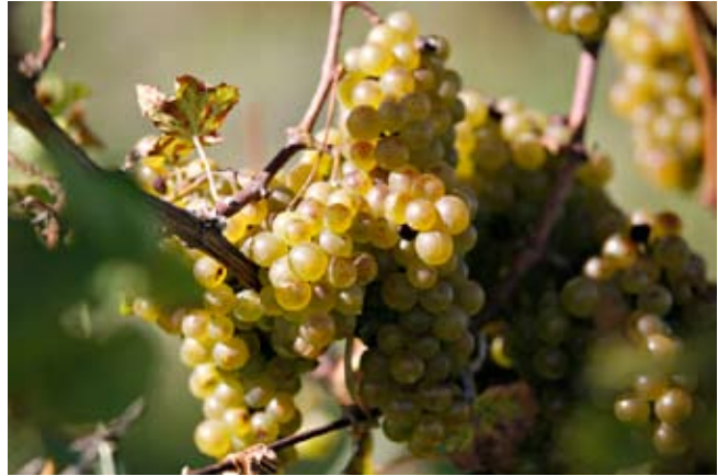
CART030-CHARDONNAY ON THE VINE