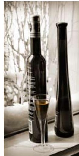
CART028-ICE WINE BY WINDOW