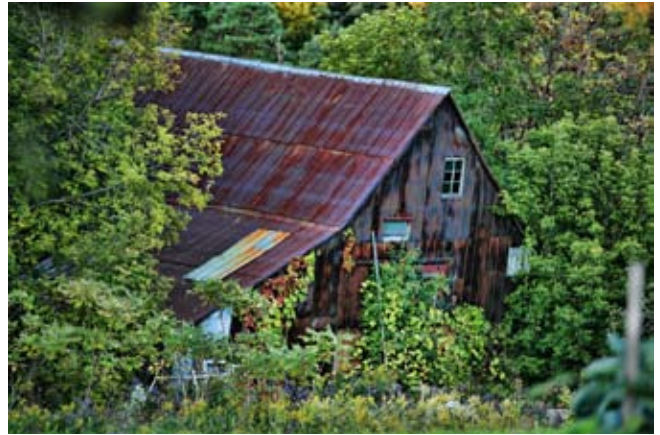
CART036-OLD BARN IN HIDING