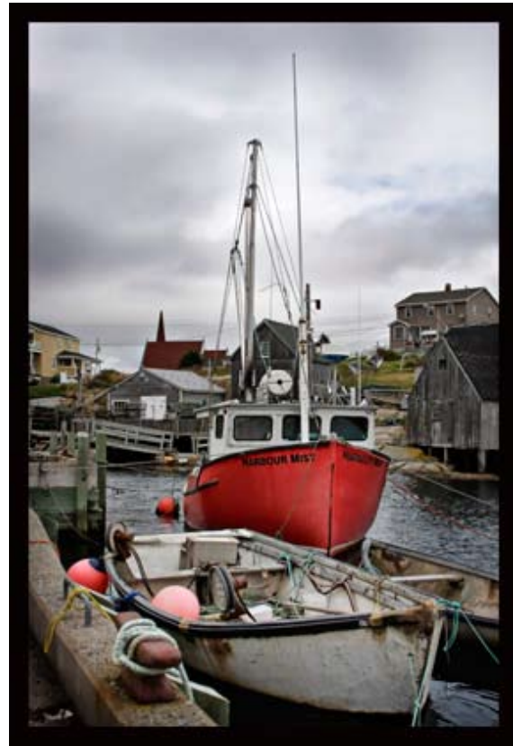
CART002 - Sleepy Bay