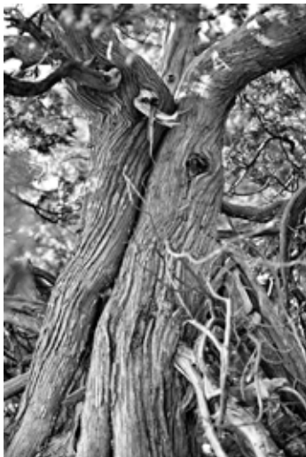
CART027-TREE OF LIFE