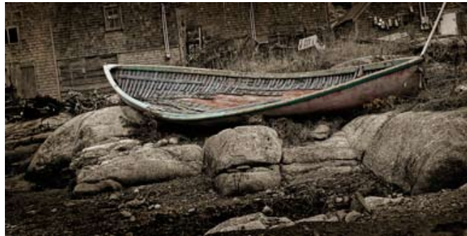
CART006 - Been There