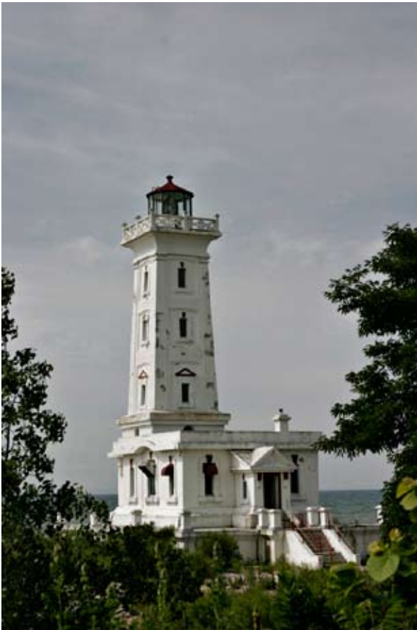
CART009 - Treasure