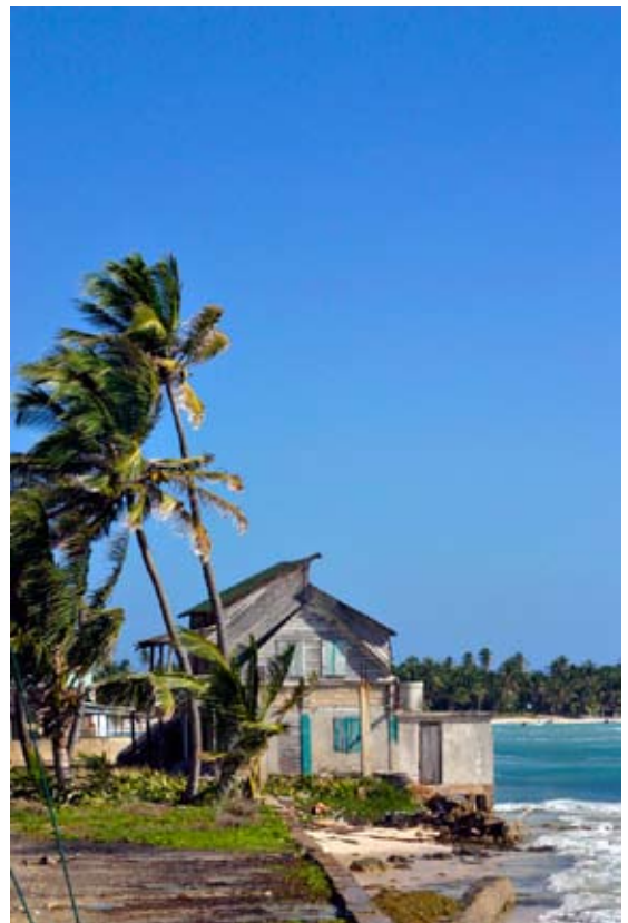
CART008 - San Andreas Island