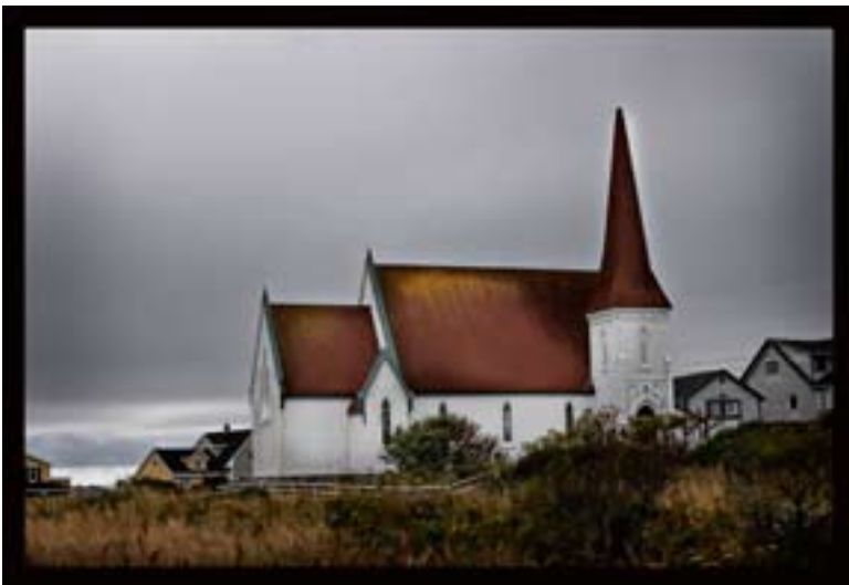
CART012 - Peggy's Chapel