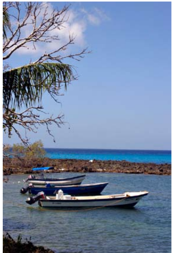
CART004 - Ready