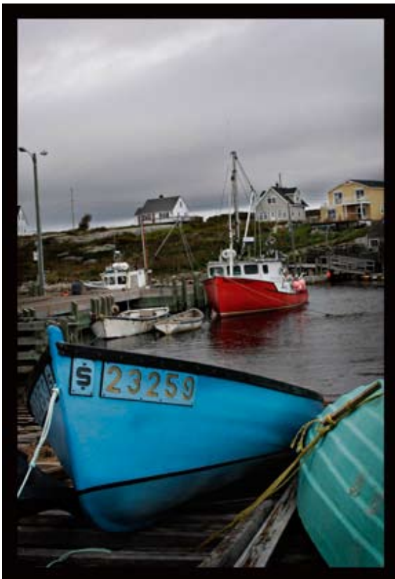
CART003 - Day Off