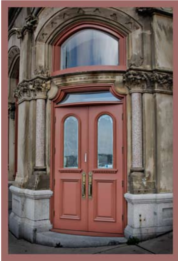
CART013 - Front Door