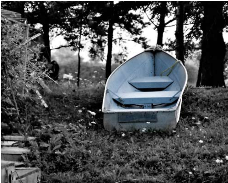
CART007 - Old Faithful