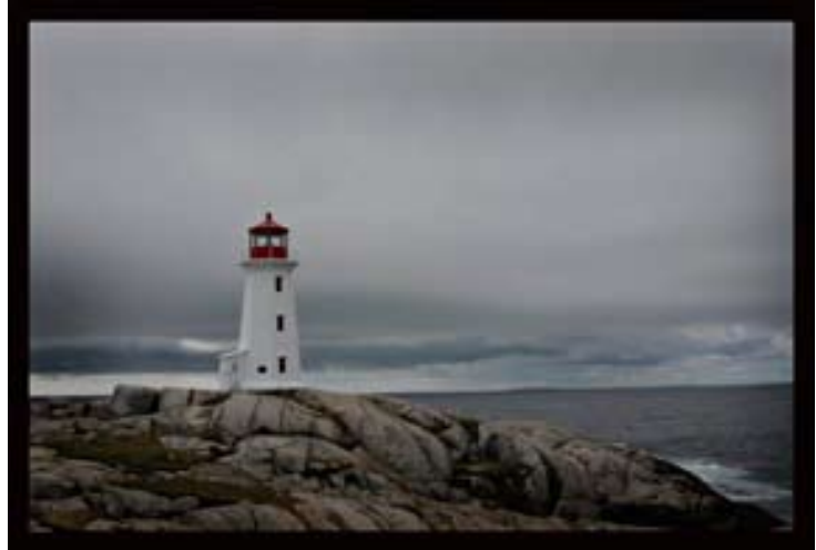
CART010 - Peggy's Cove Lighthouse