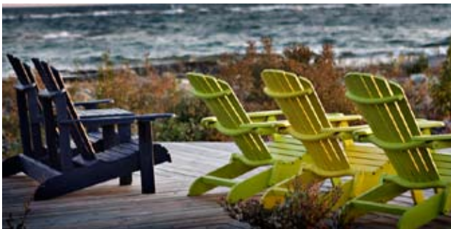
CART025-END OF THE DAY