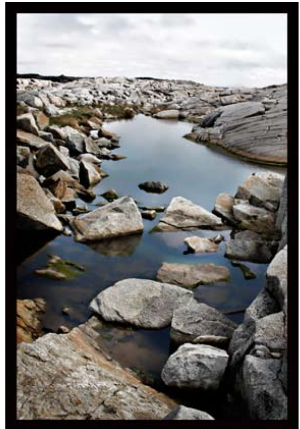
CART011 - Serenity