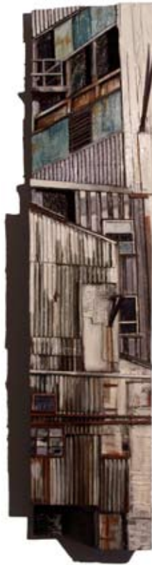
KOC010 - The narrow existence of industrial architecture