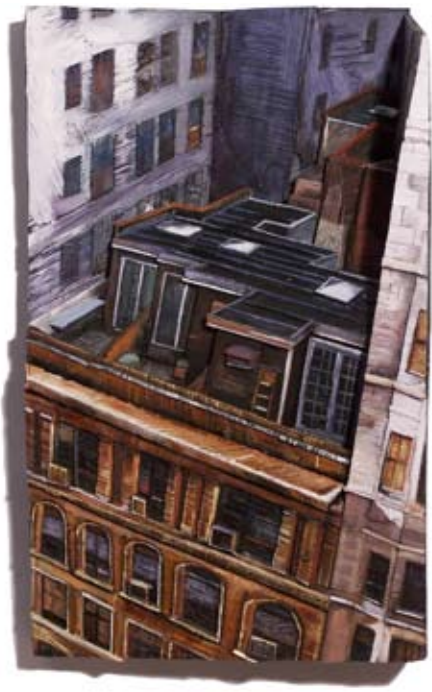
KOC001 - She liked big city living...but