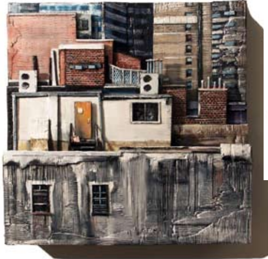
KOC004 - A little place on the roof