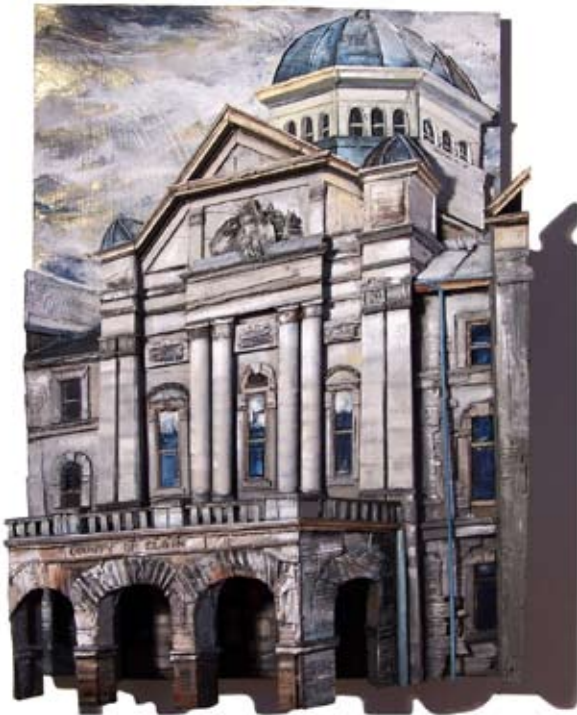
KOC012 - Elgin Courthouse