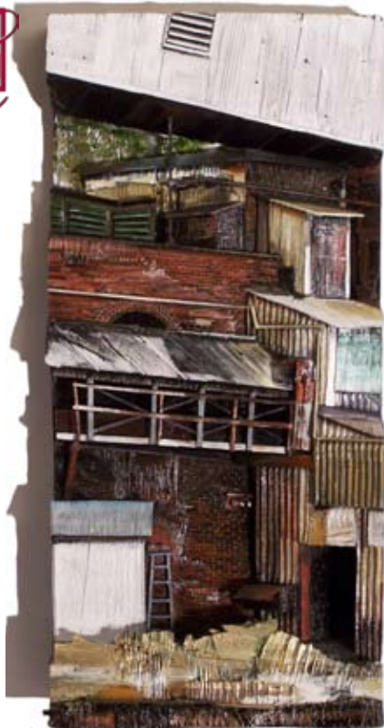
KOC009 - Along the Waterfront