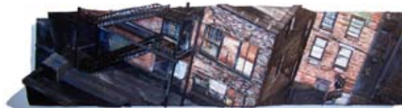
KOC007 - She wondered if her neighbours could see her too