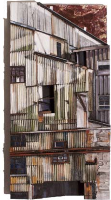
KOC011 - Remnants of a factory, now gone