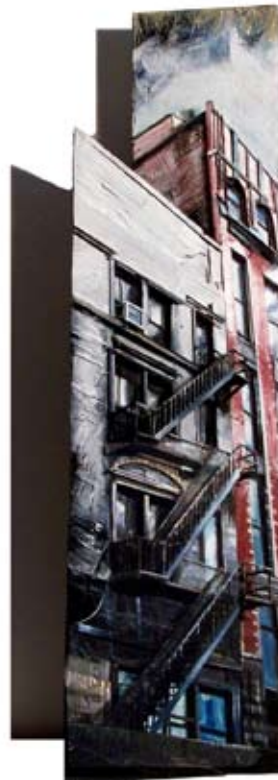
KOC013 - She said it was the building on the corner