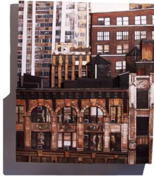
KOC002 - The need for old buildings