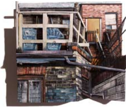
KOC003 - Just come through the back way