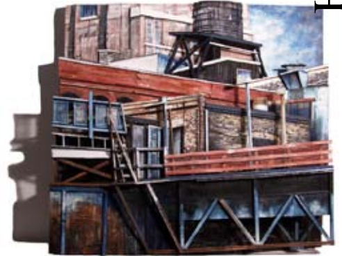
KOC005 - Overlooking the significance of passageways