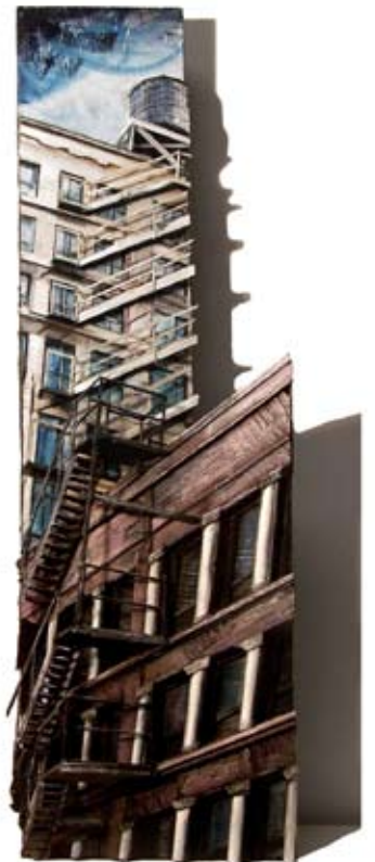
KOC014 - Looking up instead of down