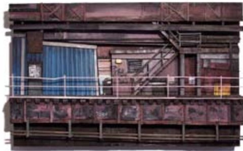
KOC006 - Stop between Midtown and Downtown