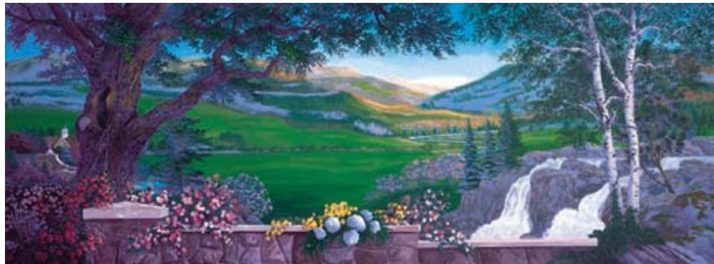
VALV005 - Berkshire Waterfall