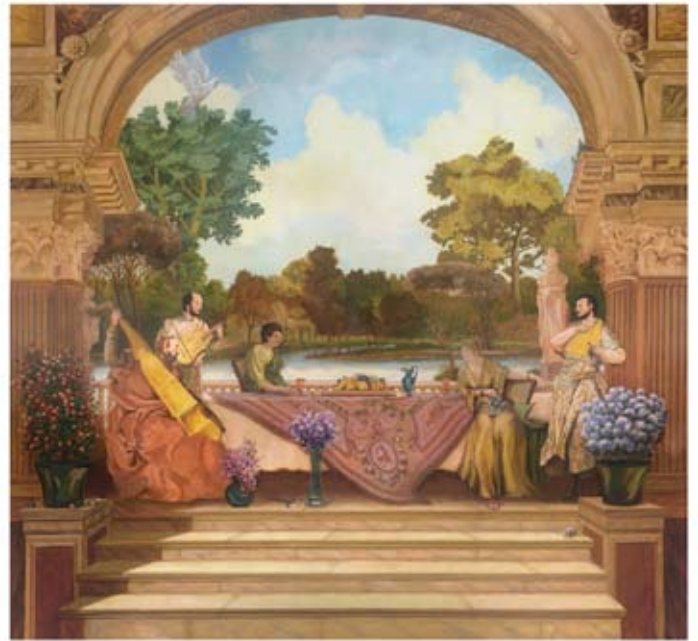
VALV008 - Roman Dining Scene