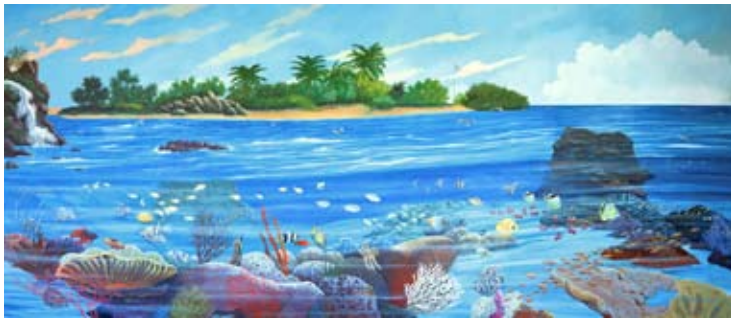
VALV003 - Beach Mural III