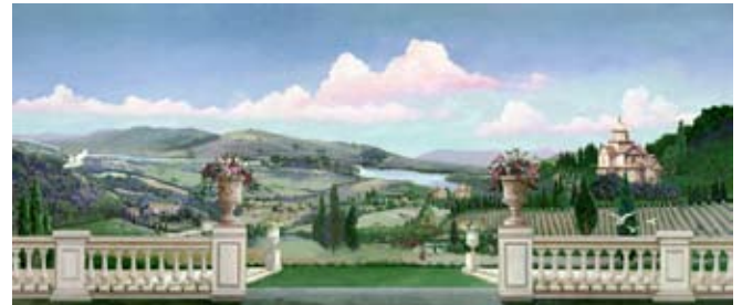
VALV004 - Tuscan Landscape