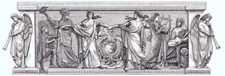
VALV010 - Timeless Frieze