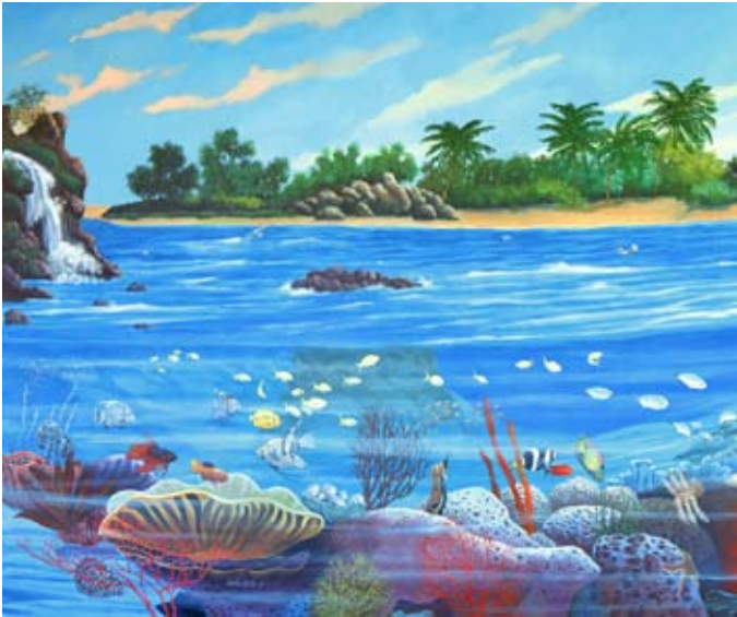
VALV001 - Beach Mural I