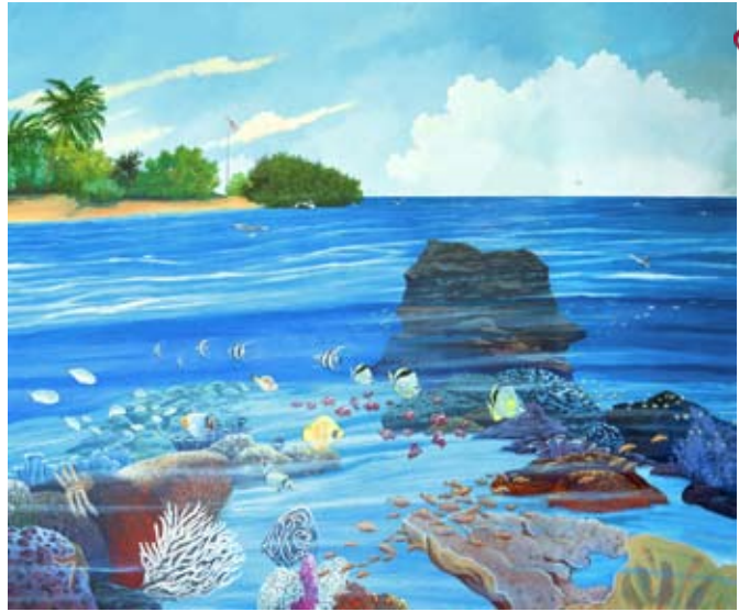
VALV002 - Beach Mural II