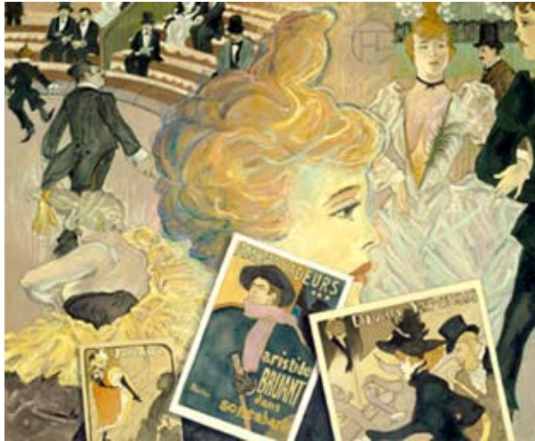
VALV009 - Home to Lautrec Mont