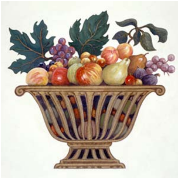
VALV007 - Orchids Bowl