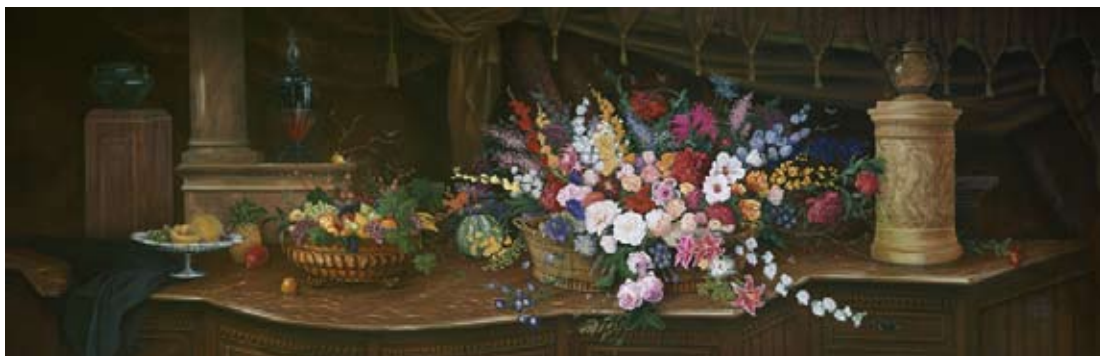
VALV006- Dutch Fruits & Flowers