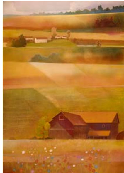
VALV012 - Barns & Fields II