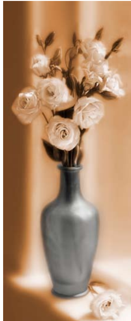
ZAL014 - Peaceful Florals II