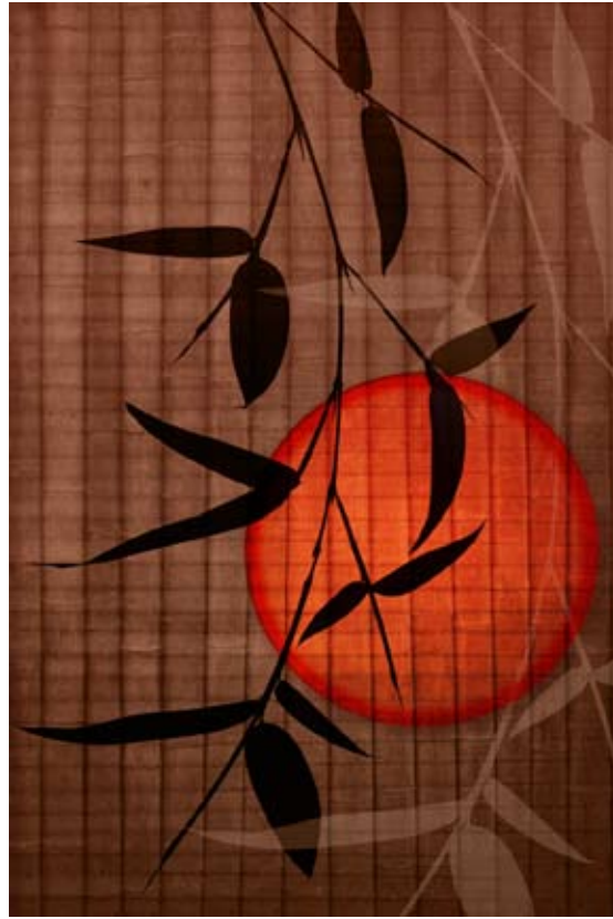
ZAL016 - Zen II