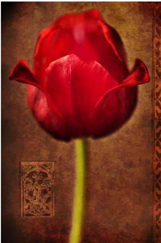
ZAL023 - vintage red tulip I