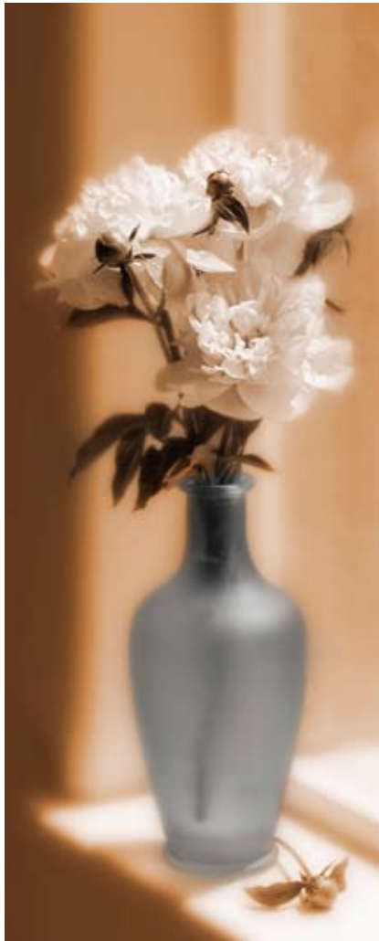
ZAL013 - Peaceful Florals I