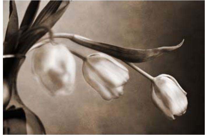
ZAL006 - Tulips Right