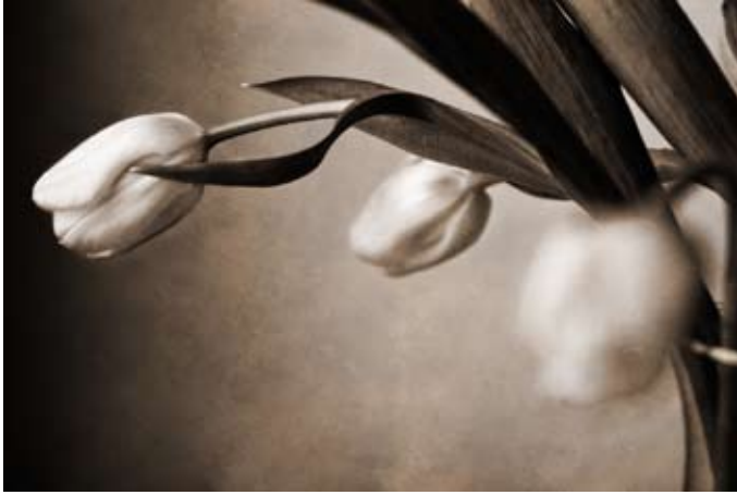
ZAL005 - Tulips Left