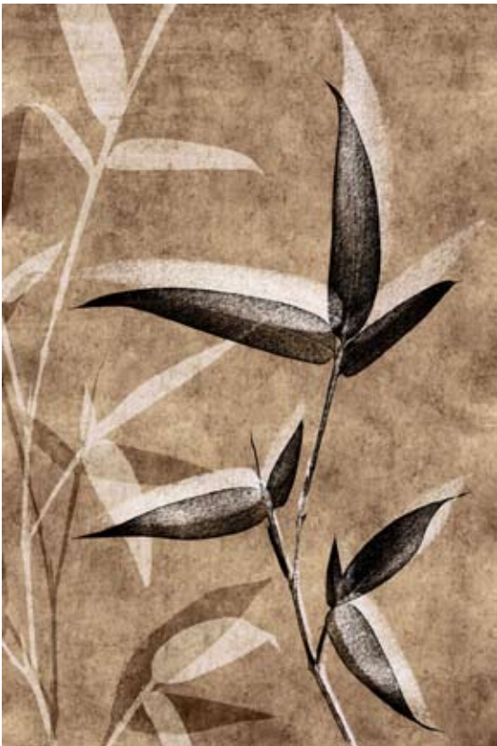
ZAL017 - Leaves I