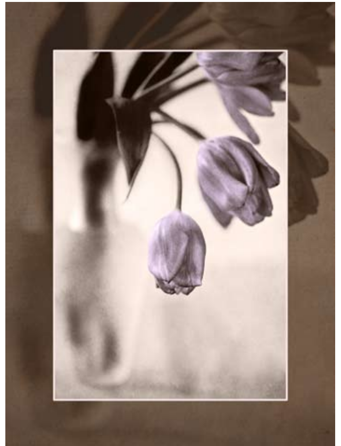
ZAL008- Violet Tulip Border II