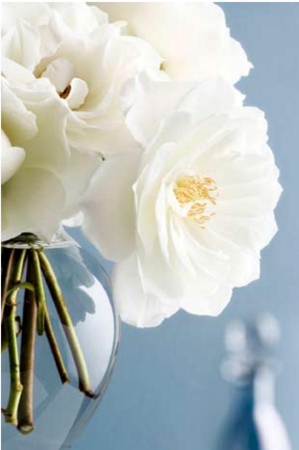
ZAL011 - White Floral on Blue I