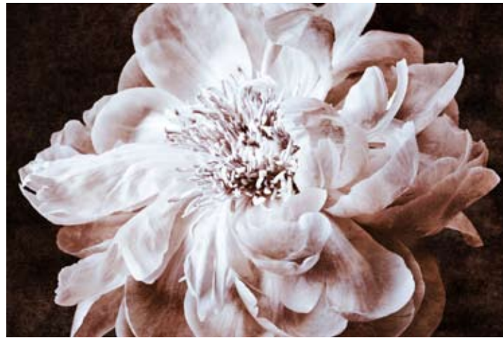
ZAL021 - sepia peony I