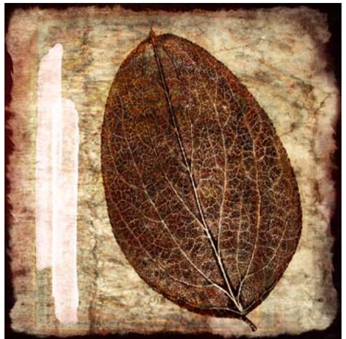
ZAL020 - fall leaves II