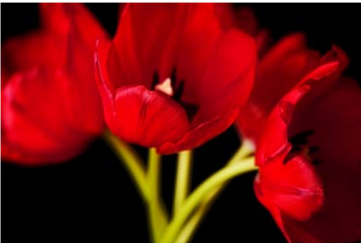
ZAL003 - Poppy Reflection I