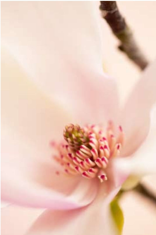
ZAL009 - Pink Serenity I