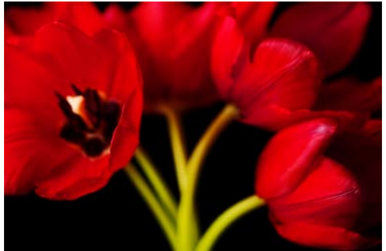
ZAL004 - Poppy Reflection II