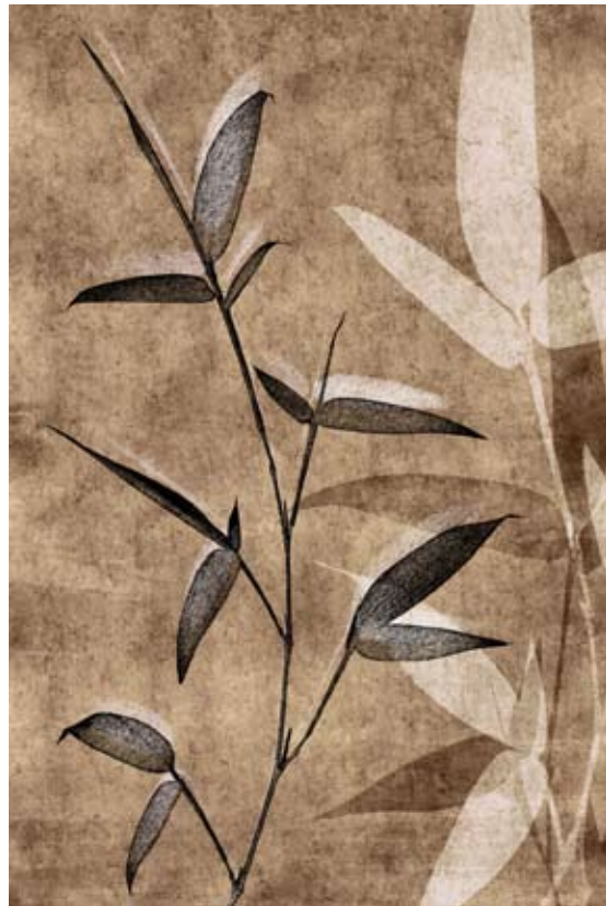
ZAL018 - Leaves II