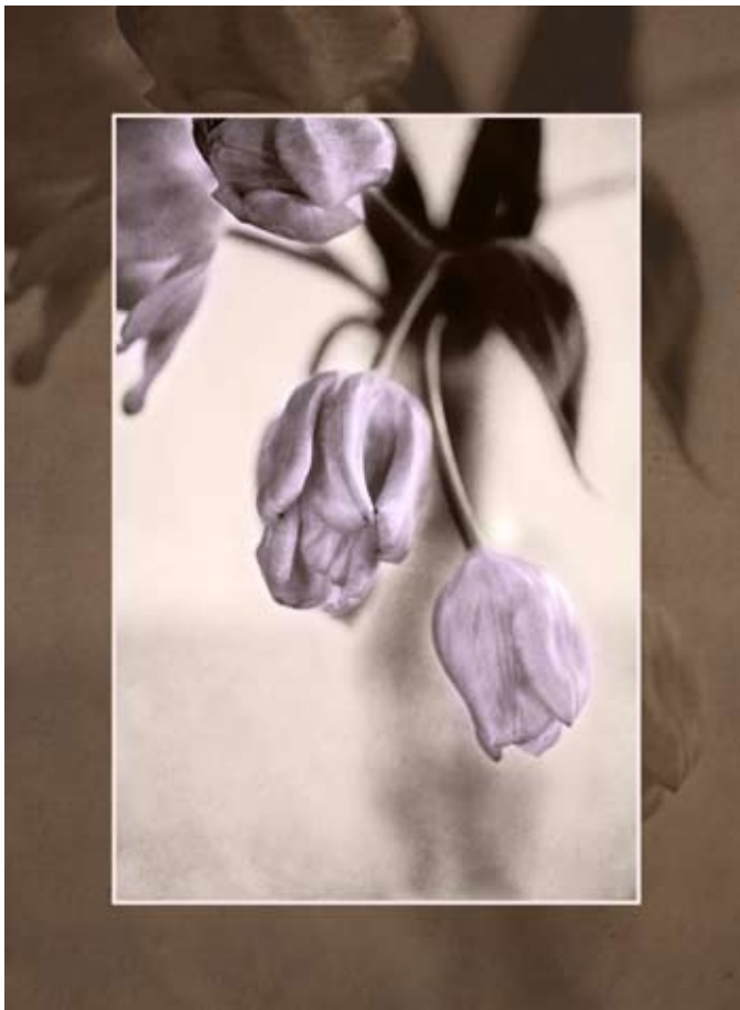
ZAL007 - Violet Tulip Border I