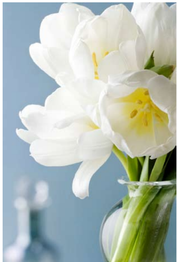
ZAL012 - White Floral on Blue II