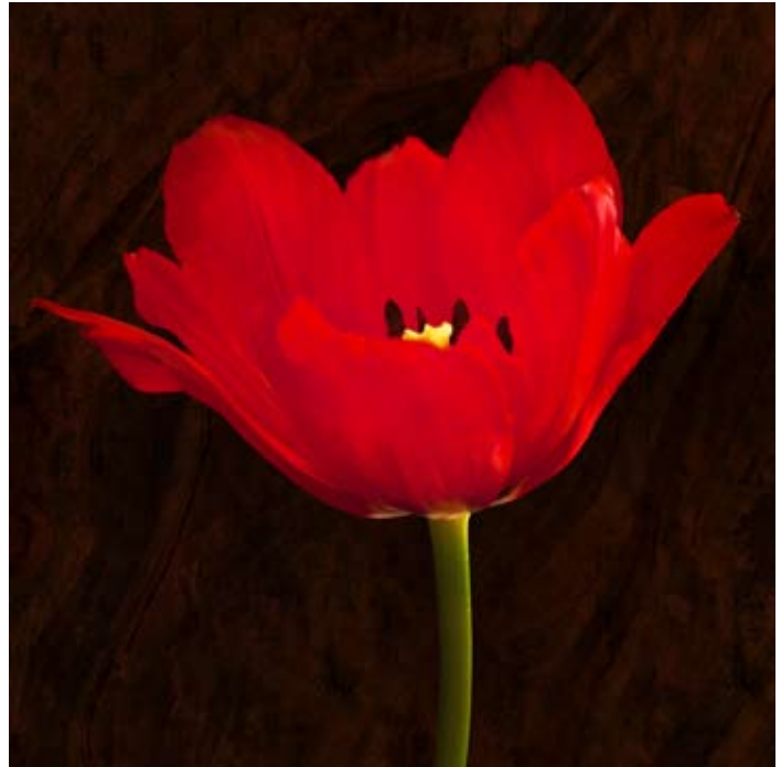
ZAL002 - Red Poppy II