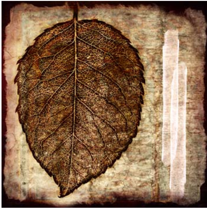
ZAL019 - fall leaves