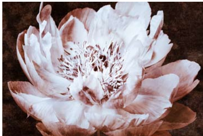
ZAL022 - sepia peony II