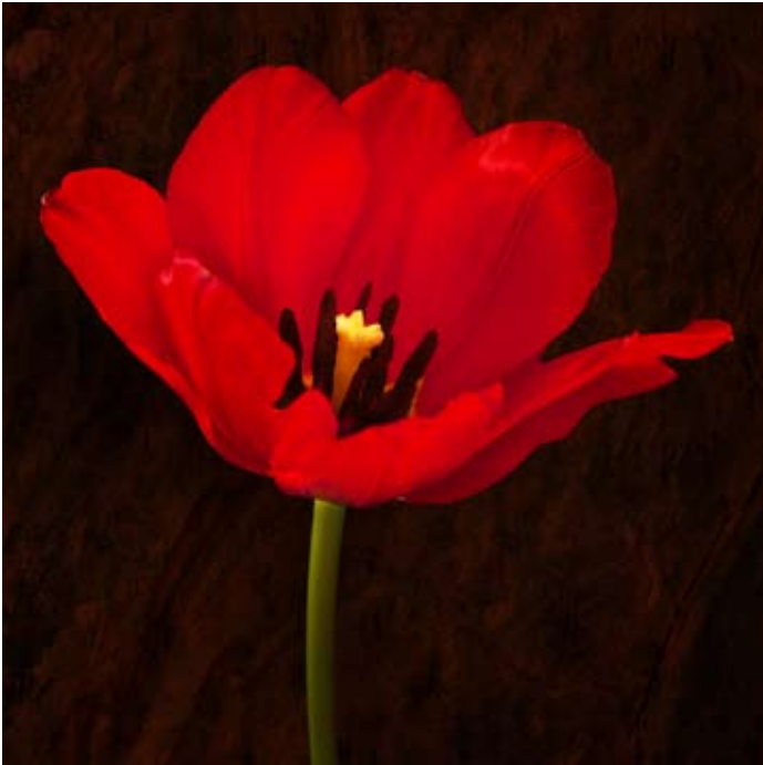
ZAL001 - Red Poppy I