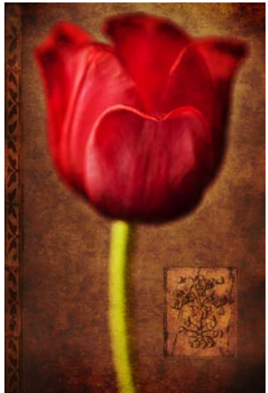
ZAL024 - vintage red tulip II