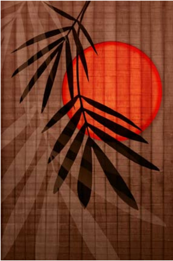
ZAL015 - Zen I